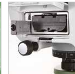
EASY DATA TRANSFER