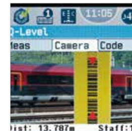
DIGITAL CAMERA AIMING