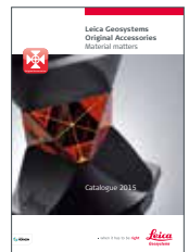
Leica Original Accessories