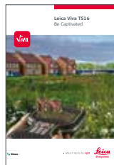
Leica Viva TS16

Illustrations, descriptions and technical data are not binding. All rights reserved. Printed in Switzerland – Copyright Leica Geosystems AG, Heerbrugg, Switzerland, 2015. 841872enus – 10.15 – INT