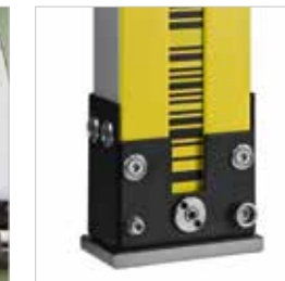
USE STANDARD INVAR STAFF