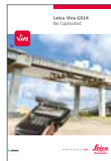
Leica Viva GS14